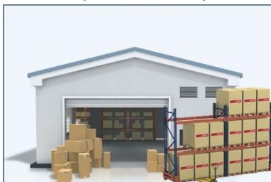
Test & Repair Centres